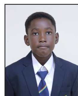
PREFECT COMMUNITY OUTREACH GODDWILL-C-DAVID (TOPAZ) 5 C